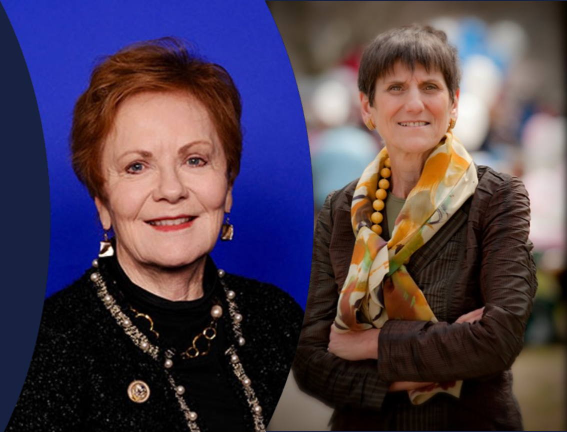
Chairwoman Kay Granger (R-TX) Ranking Member Rosa DeLauro (D-CT)