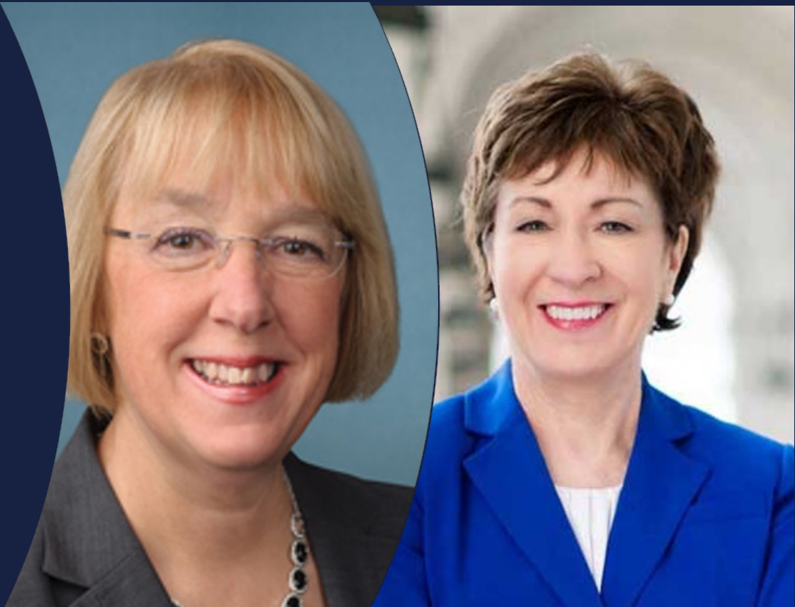
Chairwoman Patty Murray (D-WA) Ranking Member Susan Collin (R-ME)