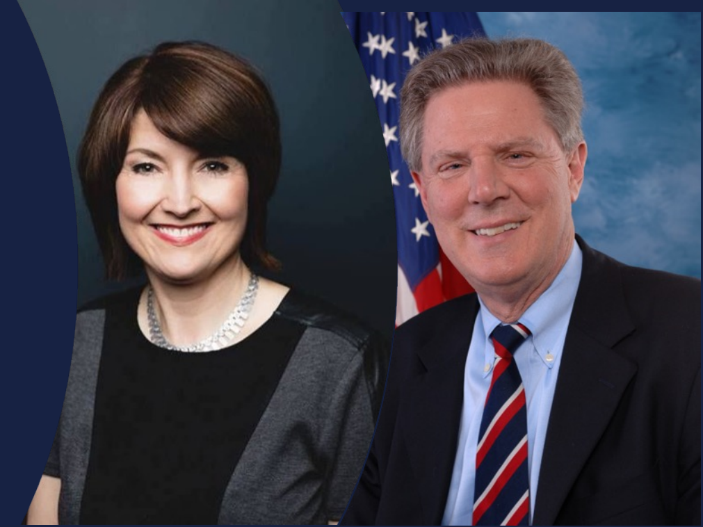
Chairwoman Cathy McMorris Rogers (R-WA) Ranking Member Frank Pallone (D-NJ)