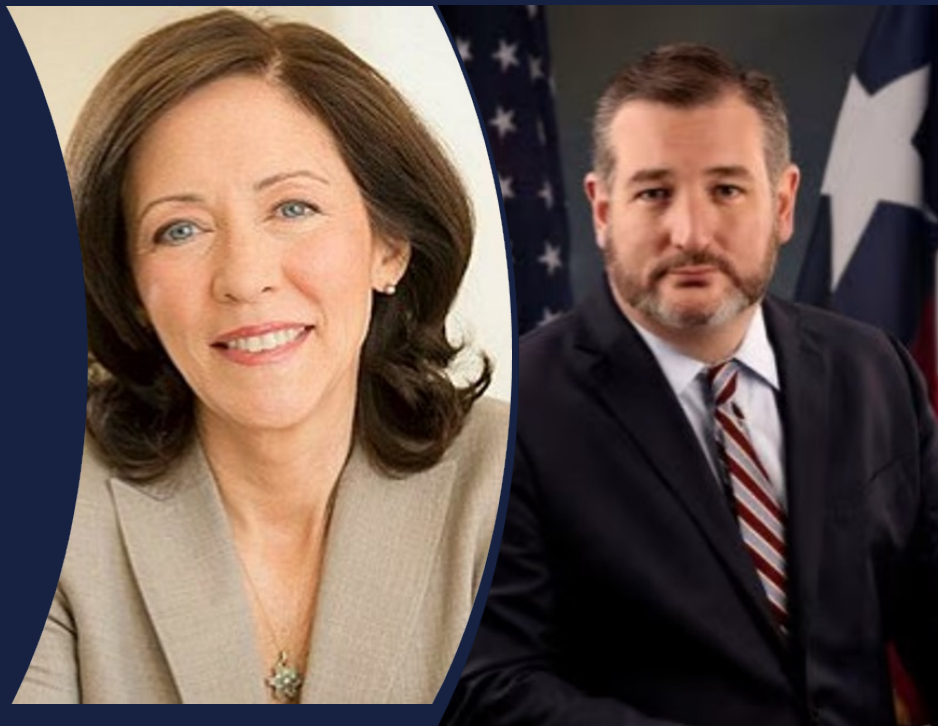
Chairwoman Maria Cantwell (D-WA) Ranking Member Ted Cruz (R-TX)

Senate Commerce, Science, and Transportation