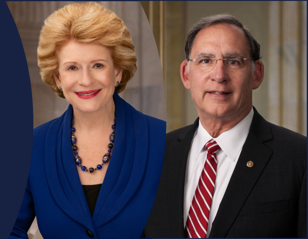
Chairman GT Thompson (R-PA) Ranking Member David Scott (D-GA)